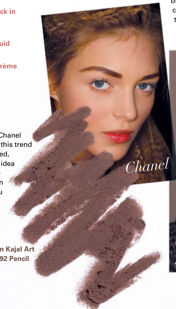
Kryolan Kajal Art No. 1092 Pencil

Don't fret; the overly theatrical bold brows seen at Chanel and Christian Dior serve more as a blueprint for how this trend should be interpreted. Even though McGrath's sculpted, '40s-inspired brows at Dior are way over-the-top, the idea behind them—a full, perfectly shaped brow—is fierce for fall. McGrath used short strokes with a dark brown pencil to exaggerate the shape of her Dior brows; you can do the same!