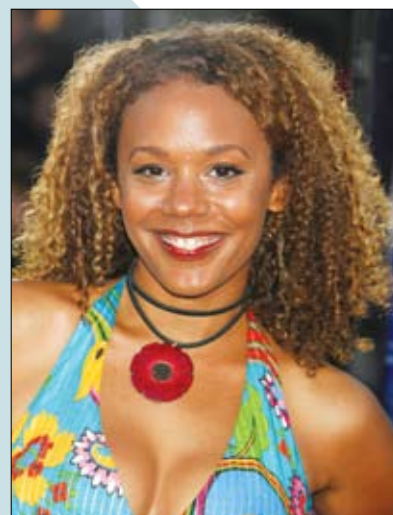
Rachel True's two-strand twist, seen here in 2006 at the Miami Vice premiere, is still a frequently requested style among curly-curly clients who want to keep their natural coils front and center.