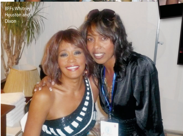
BFFs: Whitney Houston and Dixon

Dixon's fave products: White Sands Liquid Texture Firm Finish Spray and Smudge Texture Crème