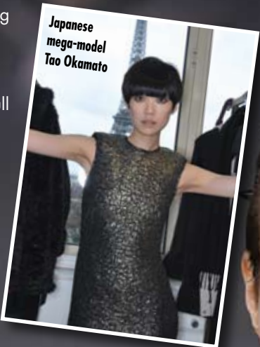
Japanese mega-model Tao Okamoto

Iris Strubegger's career-transforming crop put the industry's bookers on shorn notice.