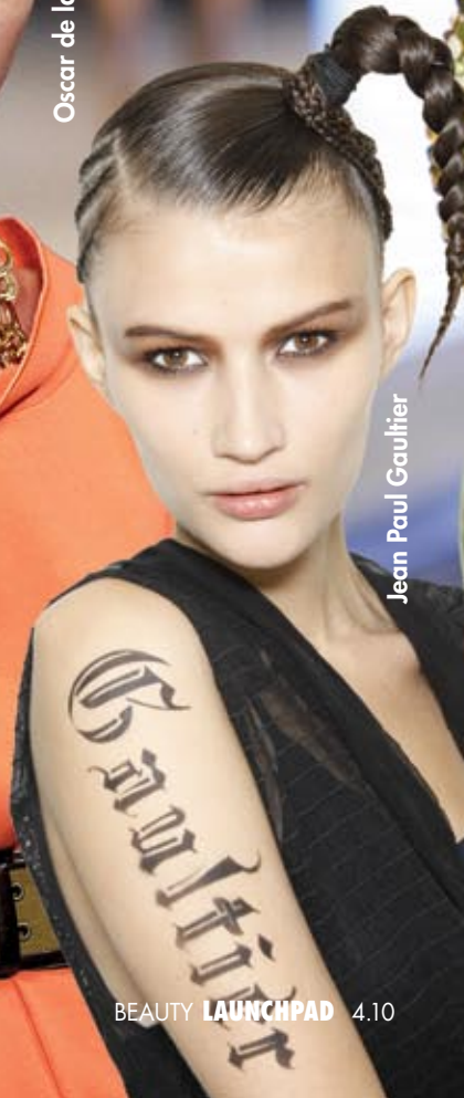
Jean Paul Gaultier