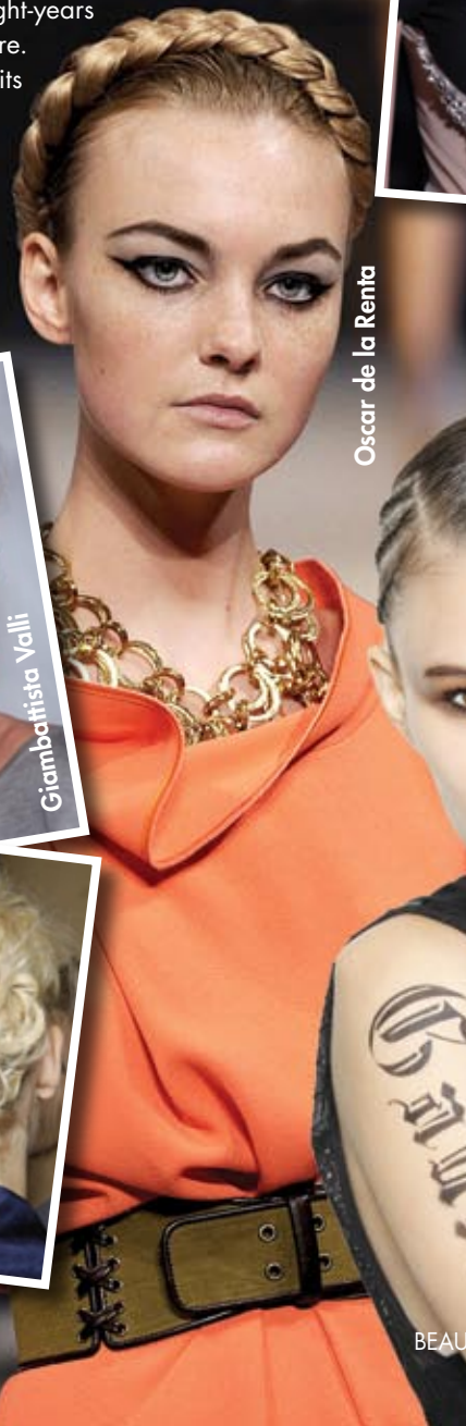
Oscar de la Renta