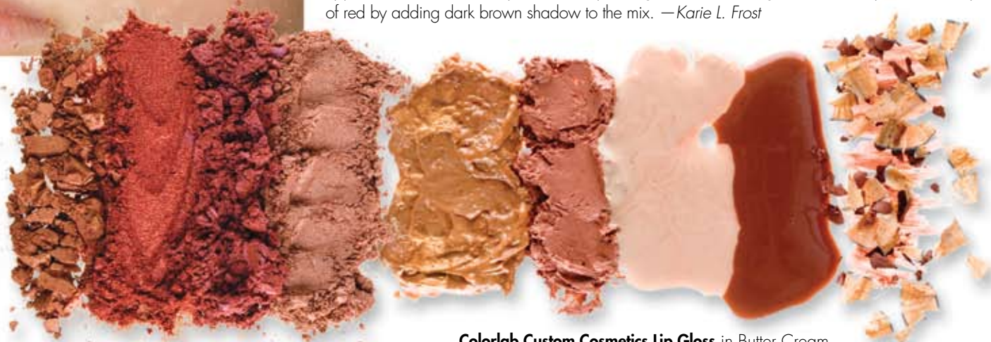
Make-up designory Eyeshadow in Cajun Spice Mehron Precious Gems in Garnet Von Natur Eye Colour in Tiger Eye Mirabella Beauty Refract Sol