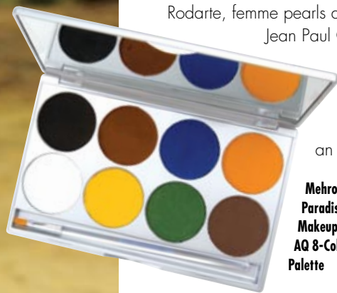
Mehron Paradise Makeup AQ 8-Color Palette

Seeking more tricks to dial down these bold beauty trends? Want to learn how to make those temporary tattoos last? Get the lowdown at BeautyLaunchpad.com .