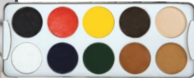
Kryolan Body Illustration Color 10-Piece Palette